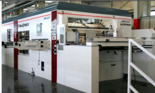
Swanline: Klett Cobra die-cutter