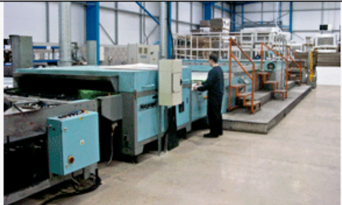
Swanline: investment in two Thieme lines