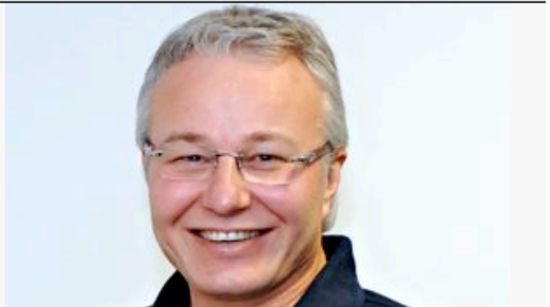
Kirkby: Die-cutter to be installed next week